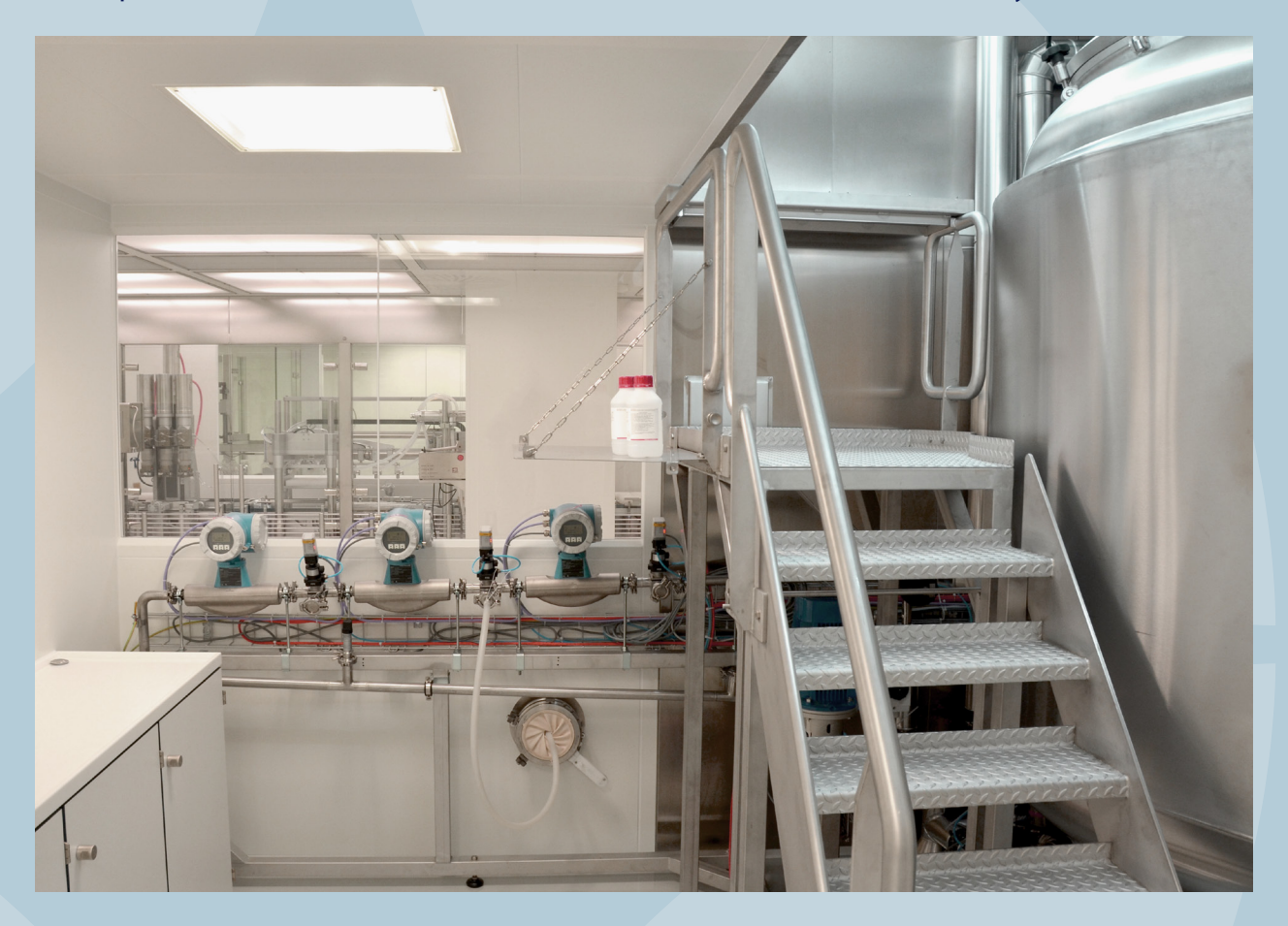
Three brand new media filling points. The large windows between rooms allows staff to communicate with ease.

The three new media filling stations can handle up to three 500 L containers simultaneously. This allows us to complete even big batch sizes within one day. The media pipes are made out of pharmaceutical standard stainless steel and are linked to the CIP/SIP system.