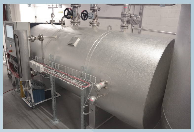
Our brand new electric steam generator reduces our carbon footprint.

The steam has multiple purposes within the manufacturing process. It is connected to the Clean-in-Place / Sterilize-in-Place (CIP/SIP) systems, the sterilizer and it is also used to produce WFI.