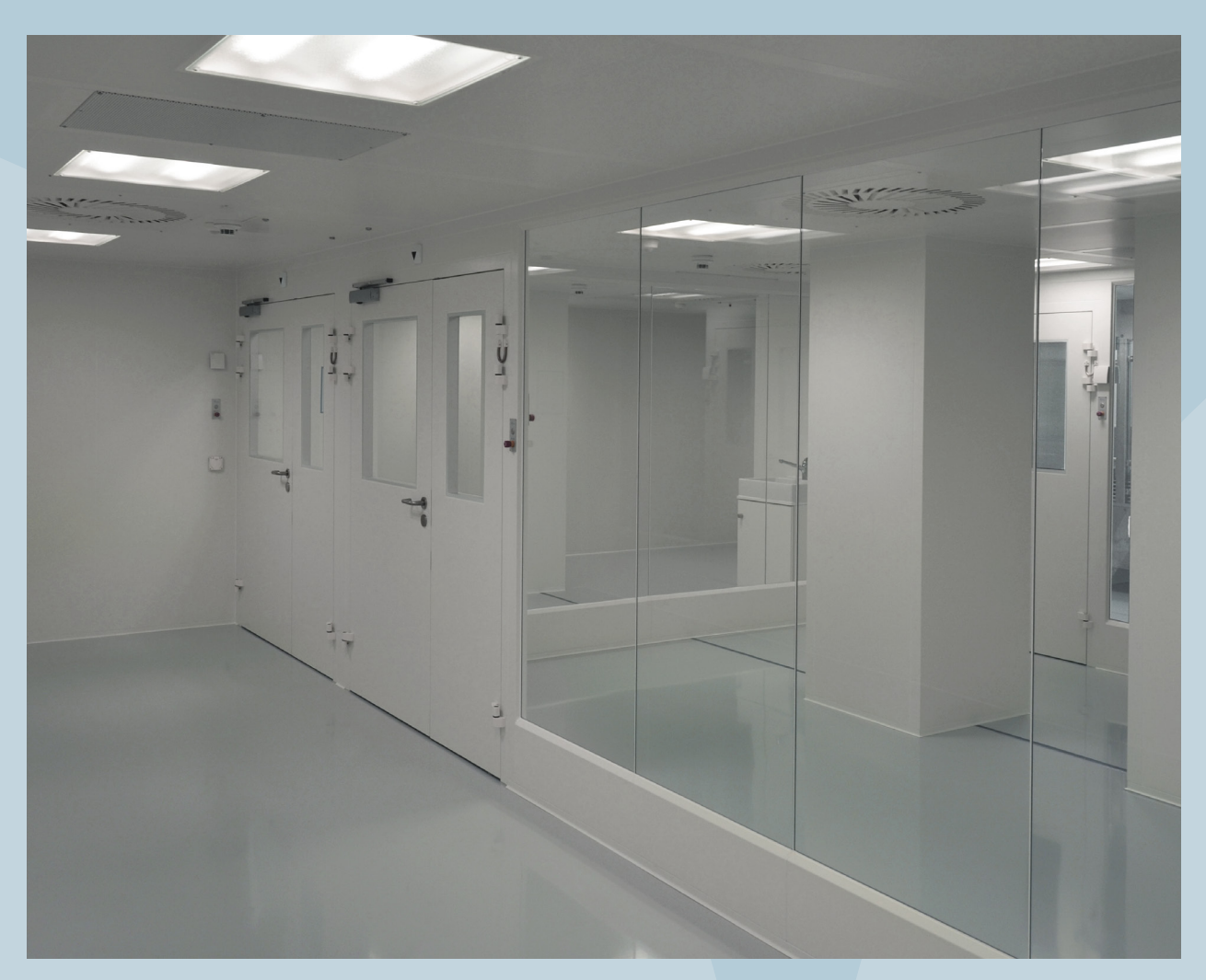
The cleanroom was designed to enable a smooth workflow of both product and personnel.

We constantly monitor and control the pressure, temperature, humidity and particle count in the air and regularly disinfect our facilities using H_2O_2 . The cleanroom filtration standards are according to ISO 5 and GMP class A guidelines.