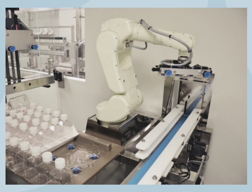
The robotic arm plays a crucial role in our new automatic filling machine.