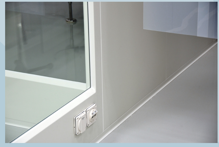
The interior is made out of materials such as glass, synthetic resin and stainless steel.

The materials used to build the interior and furniture are sleek, waterproof and are in accordance to GMP standards. We have used stainless steel, HPL, glass and synthetic resin to create such conditions. The materials have the advantage of being easy to clean, thereby minimalizing contamination, and providing an appealing working environment for the staff.