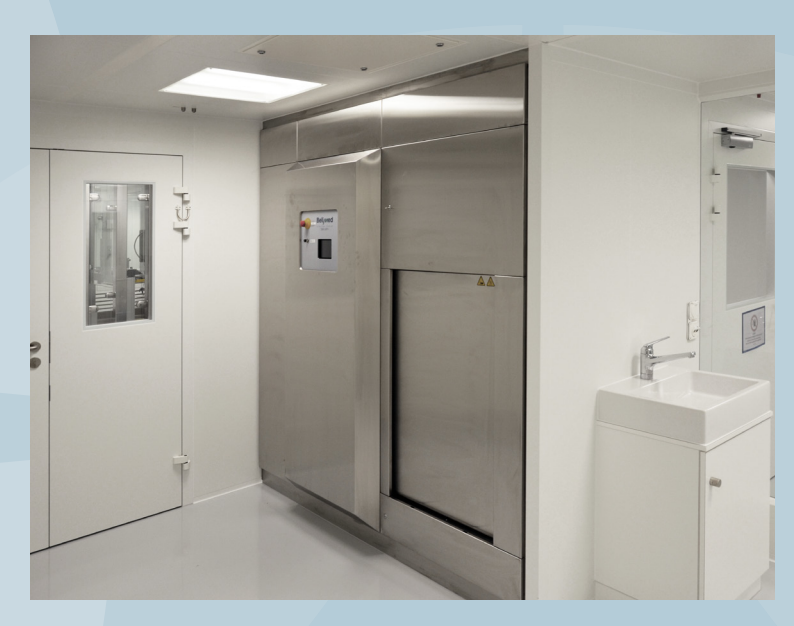
Our new Belimed steam sterilizer.

The sterilizer has been produced in Switzerland using high quality materials and components by the renowned Belimed Company. The machine is designed to disinfect both solid and porous products such as filters, rubber stoppers, and system components. The sterile filters are regularly disinfected in order to avoid crosscontamination. automated An integrity test monitors each of the filters to make sure they are operating correctly. It is a reliable GMP-compliant design.