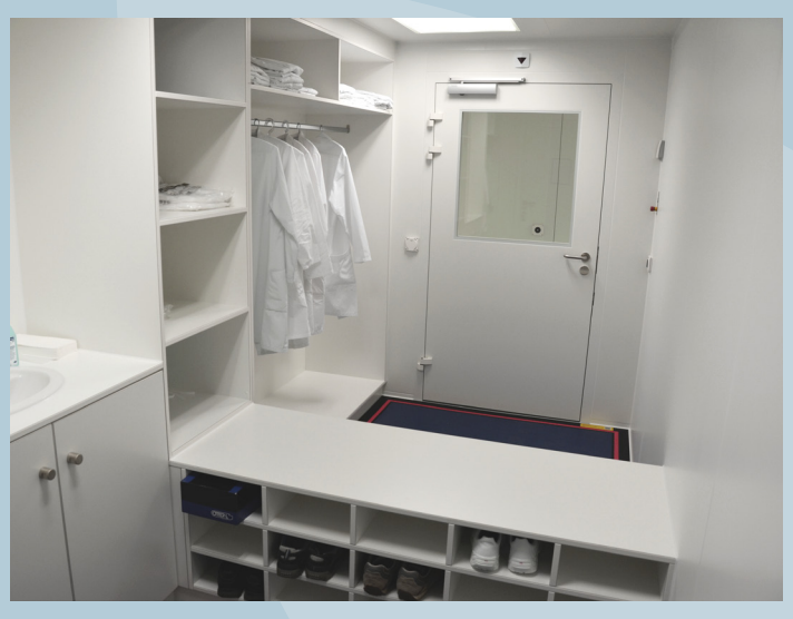
The main entrance to the liquid media plant.

The cleanroom has been constructed to be as large as needed but as small as possible in order to increase its sustainability and efficiency. Wide windows have been installed to give the plant a sense of space and increase the staff's ability to communicate throughout the facilities.