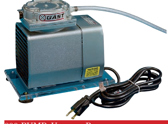
800-PUMP, Vacuum Pump

#800-DESI includes three (3) canisters filled with Molecular Sieve<sup>TM</sup> and hoses with quick disconnects. Pump not included.