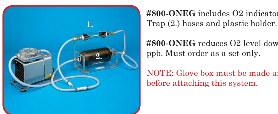
#800-ONEG includes O2 indicator (1.) Oxygen

The heater draws the internal atmosphere off the floor and pushes it up across heating elements and Palladium pellets. Any trace amounts of Oxygen are then reduced into water (H2O) vapor. The Drying Train #800-DT (see below) then removes the vapor as needed.