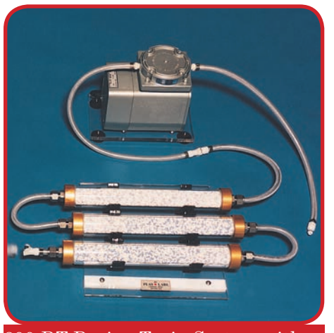
800-DT Drying Train System with Pump

#800-DT removes unwanted moisture (H2O) from the internal atmosphere of the glove box. Includes pump, hoses, and three (3) canisters filled with Molecular Sieve<sup>TM</sup> (#800-DESI).