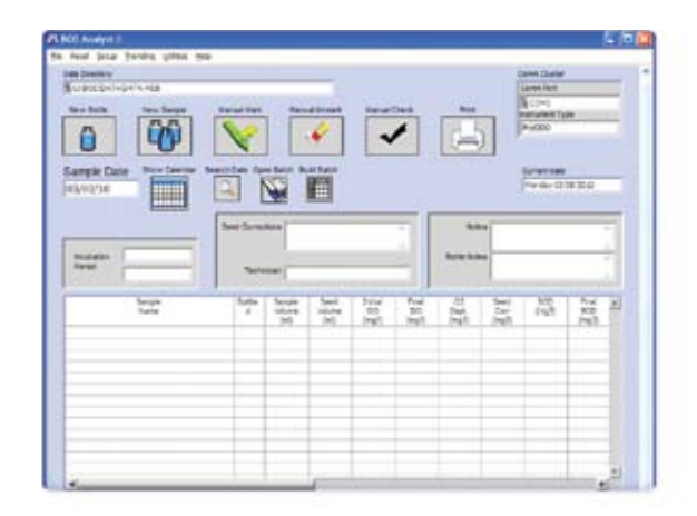
BOD Analyst Pro software automates BOD testing.