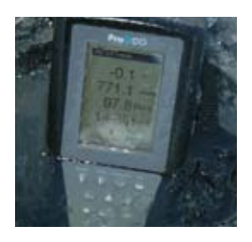
This ProODO was submerged in freezing water during a lake study. This is confidence in YSI's ruggedness.

The YSI MS (military spec), waterproof, bayonet-style keyed connectors are far superior to plastic connectors.