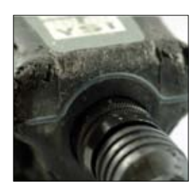
This connector had no problems after a 1/2 mile trip down a gravel road. In fact, the meter had no problems either.