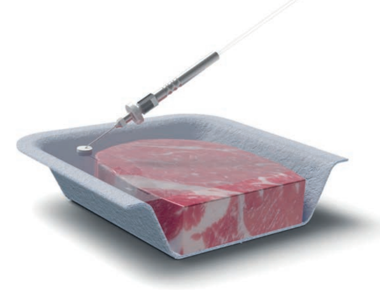
Taking a protective gas mixture sample from a food package

In order to check the mixture ratio of the protective gases inside a package, a self-adhesive septum is applied to a sampling point. The suction needle of the gas analyser is then inserted through the septum into the headspace of the package. A simple touch on the touch-screen of the device will ensure that the required sample is automatically drawn in. Within a very short time, the oxygen and carbon dioxide content is measured, the nitrogen content calculated, and the results are shown on the display.