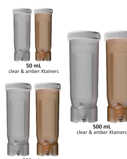
250 mL clear & amber Xtainers