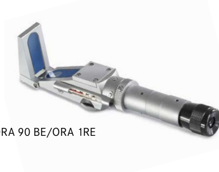
ORA 90 BE/ORA 1RE