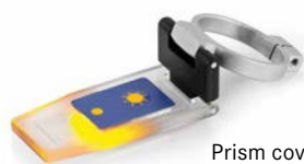
Prism coverplate with LED ORA-A1101