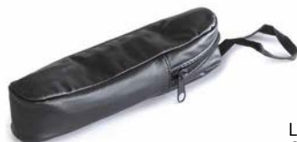
Leather bag ORA-A2103