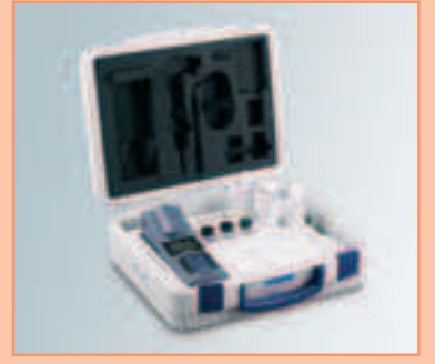
NEW: A turbidity measuring lab for in the field – the new Turb 430IR/T sets